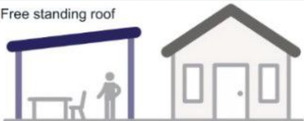
Free standing roof