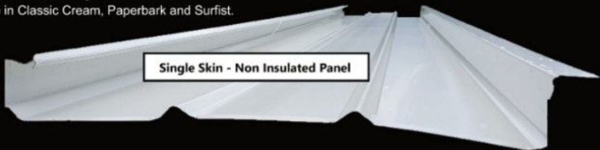
Single Skin - Non Insulated Panel