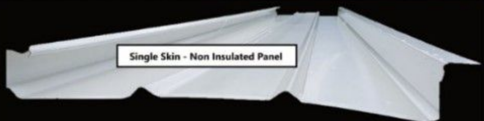
Single Skin - Non Insulated Panel

SINGLE SKIN RIB SPAN NON INSULATED ROOF SHEET