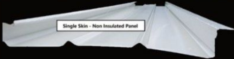
Single Skin - Non Insulated Panel